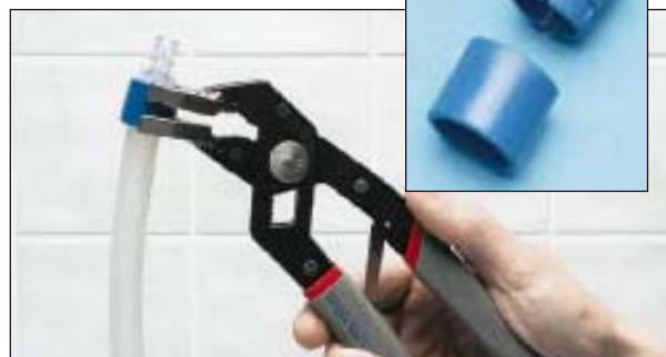
BarbLock retainer tool 30603-12