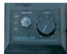
Close-up of the detachable wall-mount controller for variable-speed pumps 77110-60 and -67.

C Variable-speed pump 77110-60 is convenient and versatile.