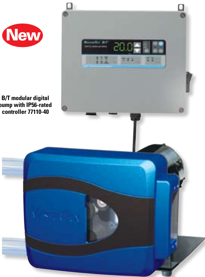
B/T modular digital pump with IP56-rated controller 77110-40