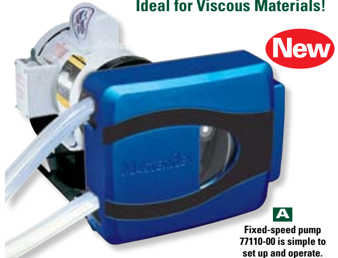
A Fixed-speed pump 77110-00 is simple to set up and operate.