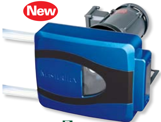
B Hazardous-duty pump 77110-20 (shown with B/T® 91 silicone pump tubing 96400-91) operates in areas where sparking could be a hazard.