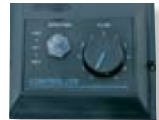
Close-up of the detachable wall-mount controller for variable-speed pumps 77110-60 and -67.

C Variable-speed pump 77110-60 is convenient and versatile.