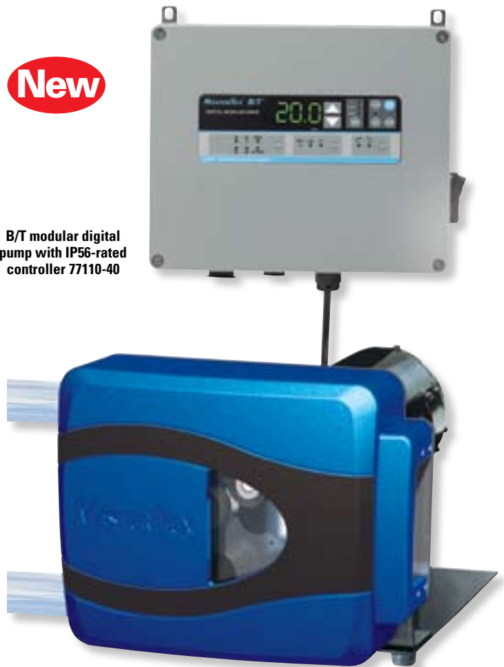
B/T modular digital pump with IP56-rated controller 77110-40