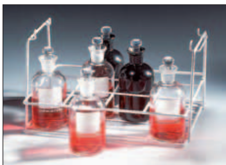
Bottles 03660-15 and 03662-10 shown in rack 03660-20

Mix and match packs or cases of items from "red" tables to save!